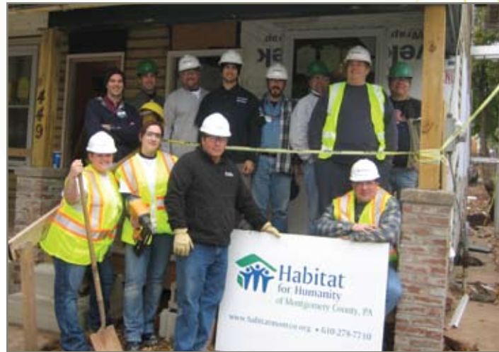
A group of volunteers from ABC member company Skanska USA Building, Inc. helped Habitat for Humanity build a duplex in Montgomery County, Pa.

During the 2007 Excellence in Construction and National Safety Excellence awards ceremony in Washington, D.C., ABCares detailed some of the previous year's most notable community service projects in a video presentation viewed by the more than 2,000 attendees. Throughout the year, ABCares showcased selected community service projects on the ABC website and in ABC's Construction Executive magazine.